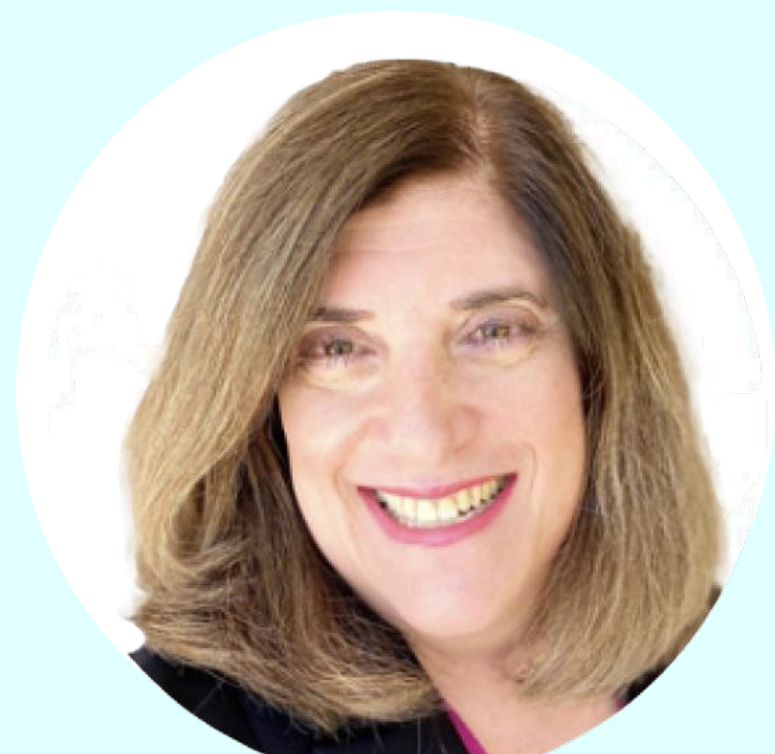
Randi Levin WIT Committee Former CIO, Jet Propulsion Lab (JPL)